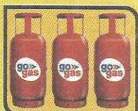
Packed Cylinder Marketing